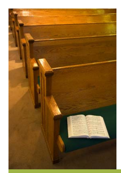
Olsen Park church of Christ

We must firmly stand in opposition to the moves made by the denominational world to use the pulpit and the local church to promote political causes, candidates, or parties. Paul told Timothy that the church is the "pillar and ground of the truth" (1 Timothy 3:15). The church has a spiritual focus which (frankly) is more important than geo-