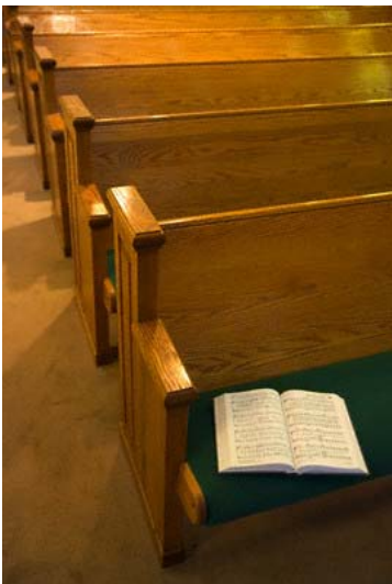
Olsen Park church of Christ

“The Lord meant,” he said, “for us to meet.” He told me how the Lord would “tell him things” and how he often talked to the angel Gabriel. We exchanged some information and I encouraged him to come and worship where I preached sometime (hopefully when he was sober).