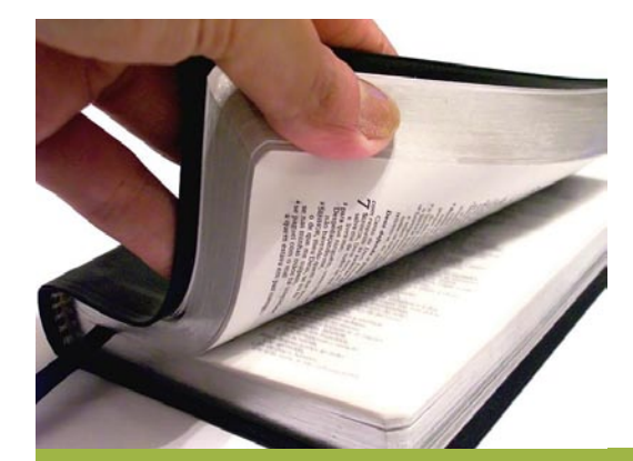
Olsen Park church of Christ

We could go on with a list like this forever! The person who delivers your mail, the teenage girl who babysits your kids, the guy sitting across from you in the waiting room, the mom sitting next to you in the bleachers, and the repair