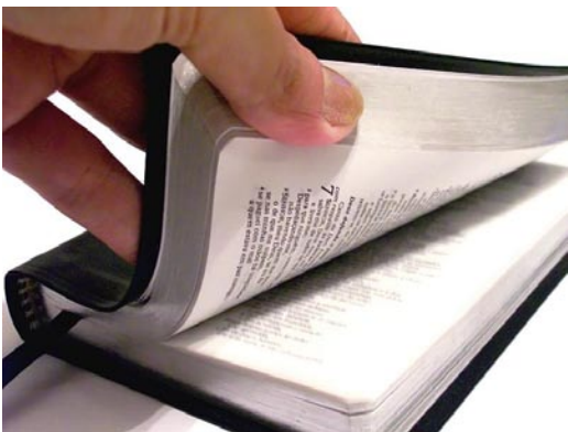
Olsen Park church of Christ

3. Motion requires an “Unmoved Mover.” This is a very ancient observation of nature. All around us the universe is in motion. This is true of physical motion and also of processes of nature. Everything has a source, an origin, a cause,