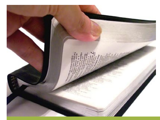
Olsen Park church of Christ

So it is when we proclaim the truth to those around us. Some will rejoice—we have spared them a penalty they didn't realize they faced.