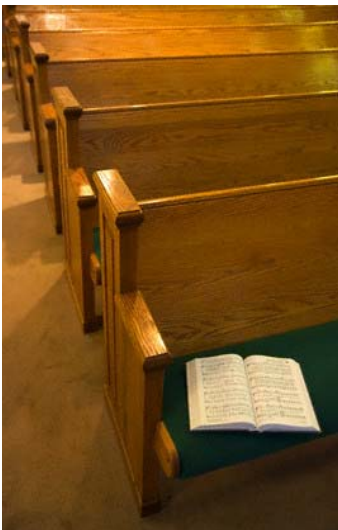
Olsen Park church of Christ

that government might intrude too much into the lives of private citizens, it is not uncommon to hear the current leaders characterized as “Big Brother,” and their actions compared to Orwell’s vision. This was true when George W. Bush passed the Patriot Act in 2001, and it is true of President Obama’s current moves towards increased gun control, and the Affordable Care Act, (or “ObamaCare”). We simply don’t want to feel as if “Big Brother” is watching us.